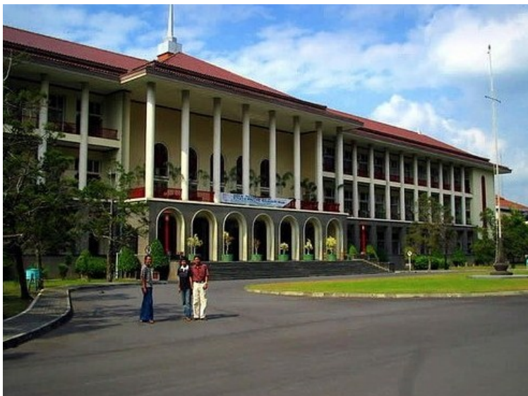
Gadjah Mada University, Yogyakarta, Indonesia

“the secular,” a vocabulary that is often used by religious and non-religious people alike in Western culture to reinforce the perception that these two spheres of life are radically distinct and opposed. Indonesia offers an opportunity to research how these categories do or do not apply in this particular non-Western and non-Christian context.