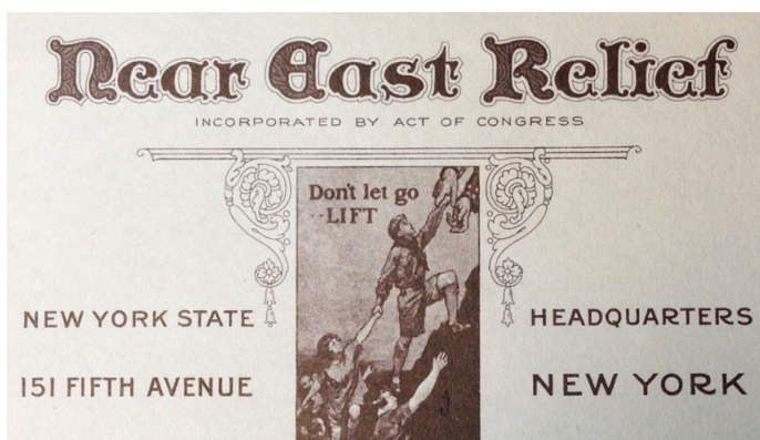
Near East Relief Committee Records