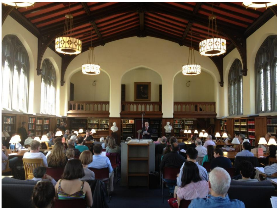
Final Concert of the Year